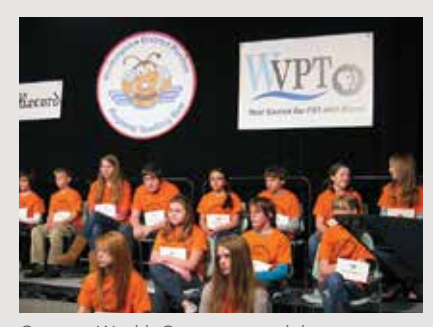
CommonWealth One sponsored the Scripps Regional Spelling Bee, Harrisonburg.